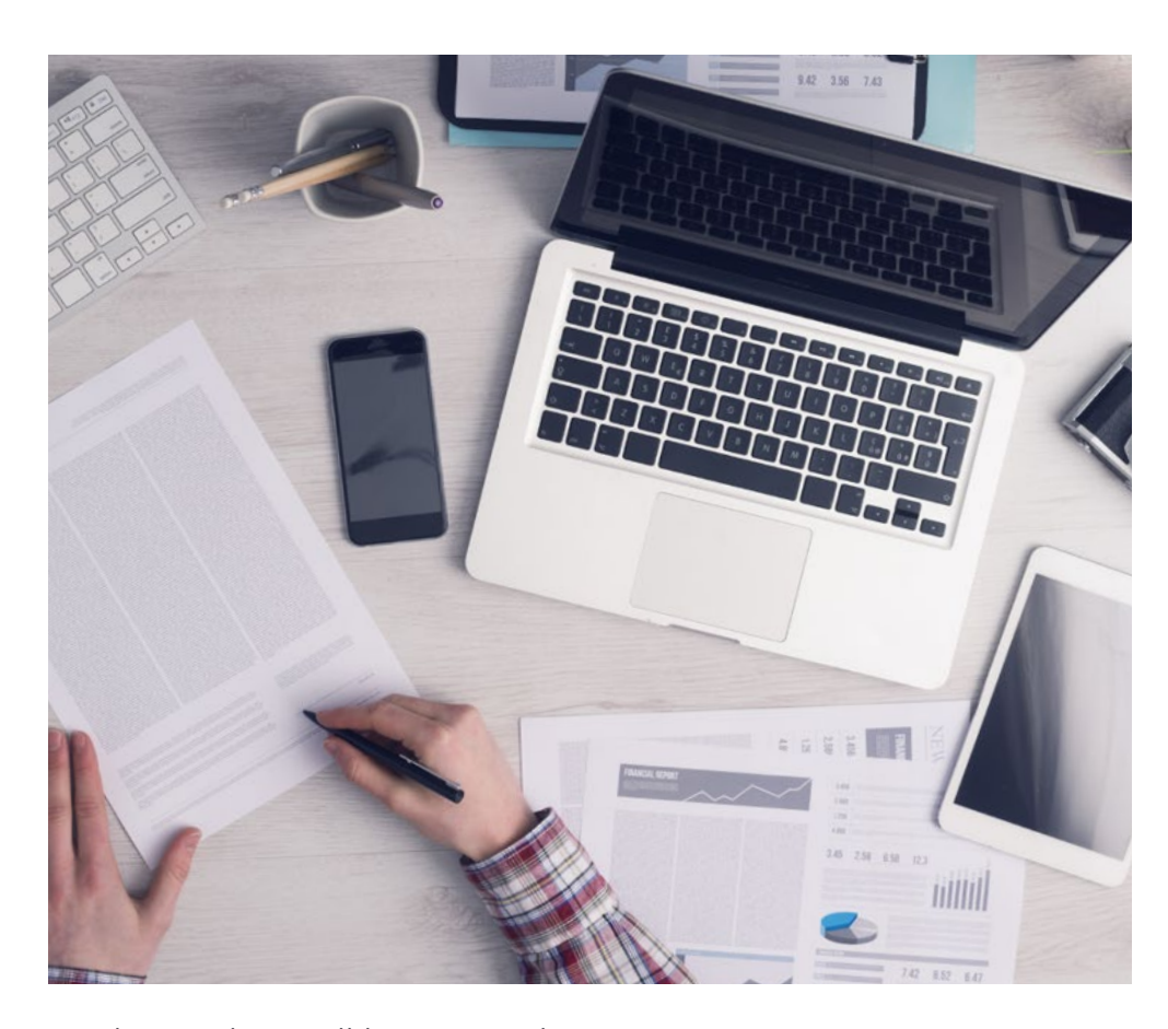
The student will learn to solve complex situations in real business environments through collaborative activities and real cases.