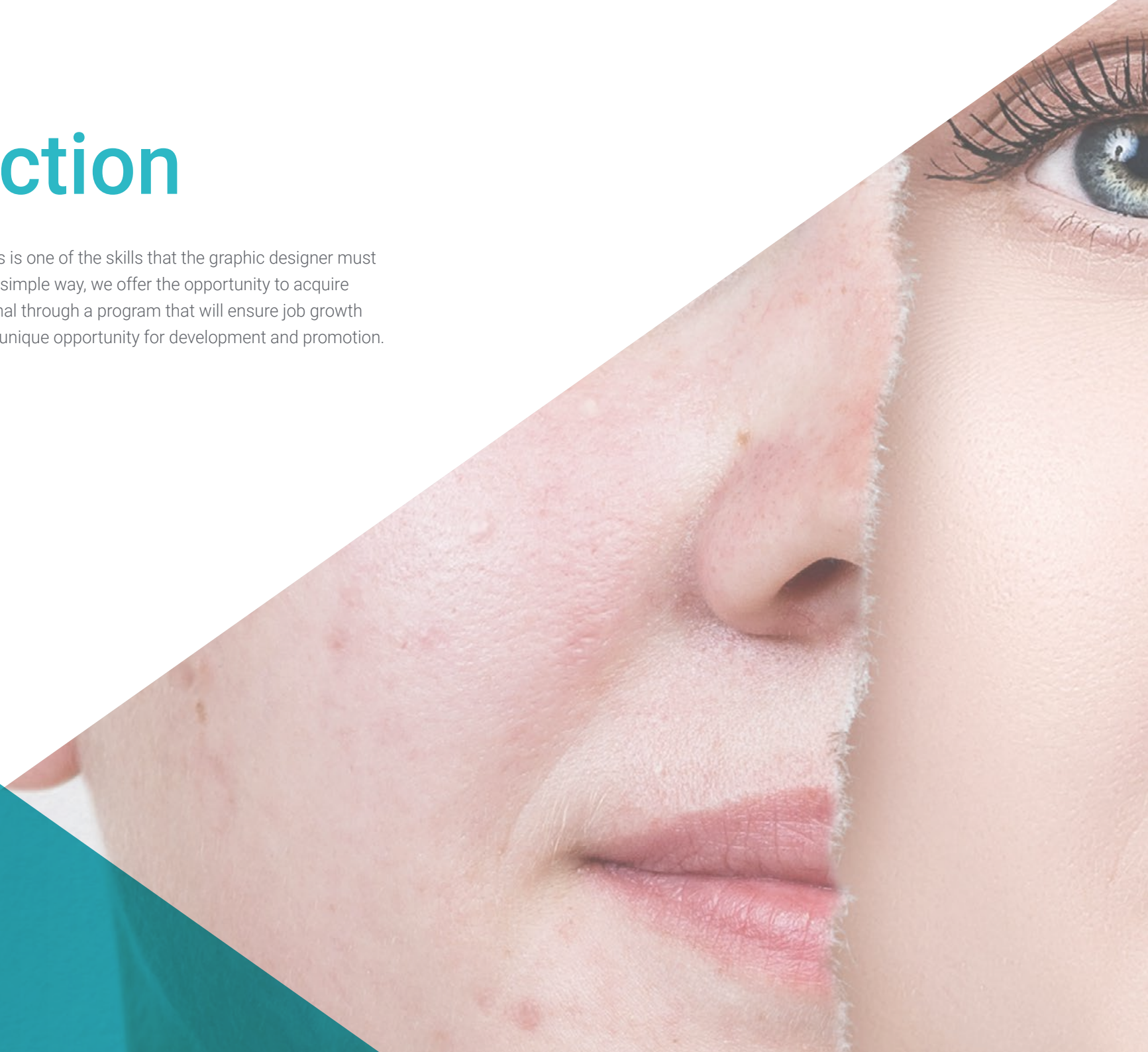
Image processing for use in designs is one of the skills that the graphic designer must master. In order to achieve this in a simple way, we offer the opportunity to acquire the skills of a specialized professional through a program that will ensure job growth without problems of conciliation. A unique opportunity for development and promotion.